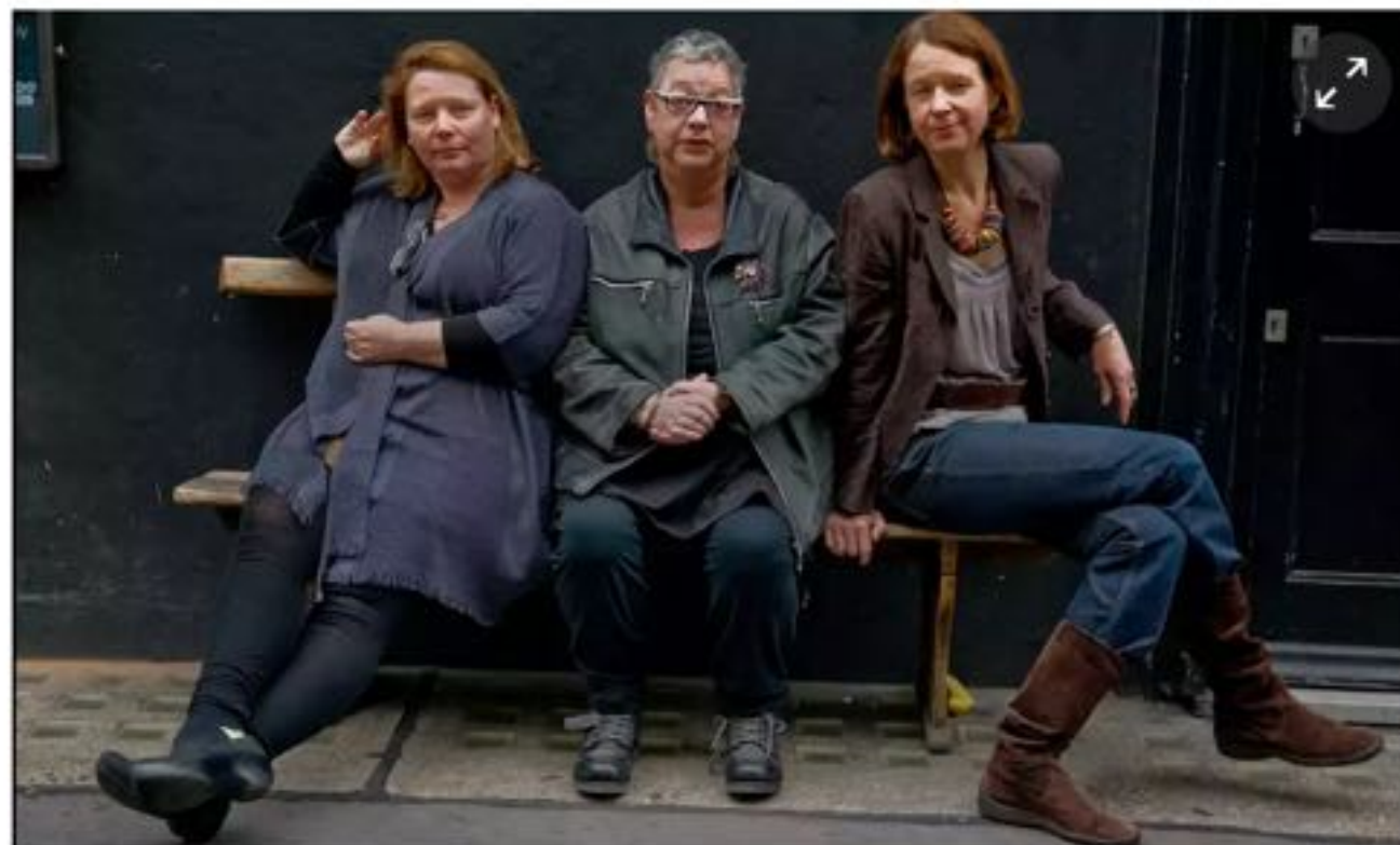
Jo Scanlan, Jo Brand and Vicki Pepperdine of the BBC comedy series Getting On, in which Pepperdine's character, Dr Moore, calls everyone 'gents'.

Campaigners argue that referring to female work colleagues as 'guys' may cause offence. Many feminists disagree