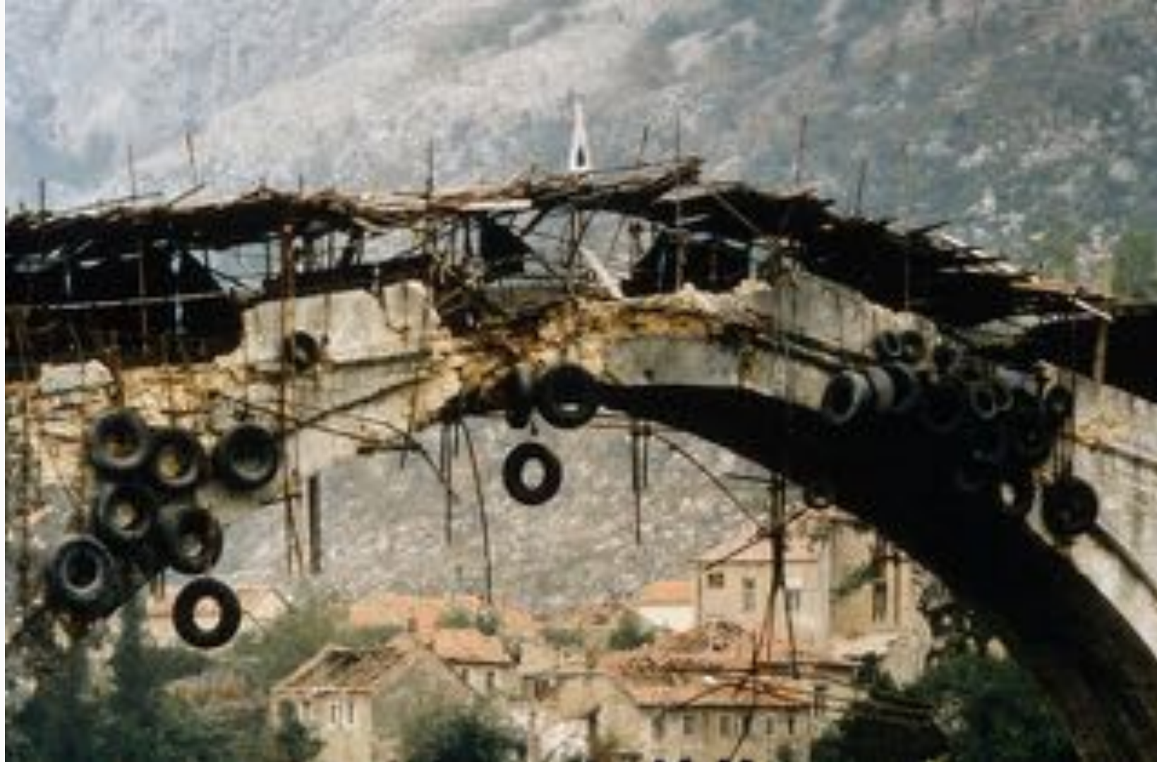
Mostar, Bosnia and Herzegovina