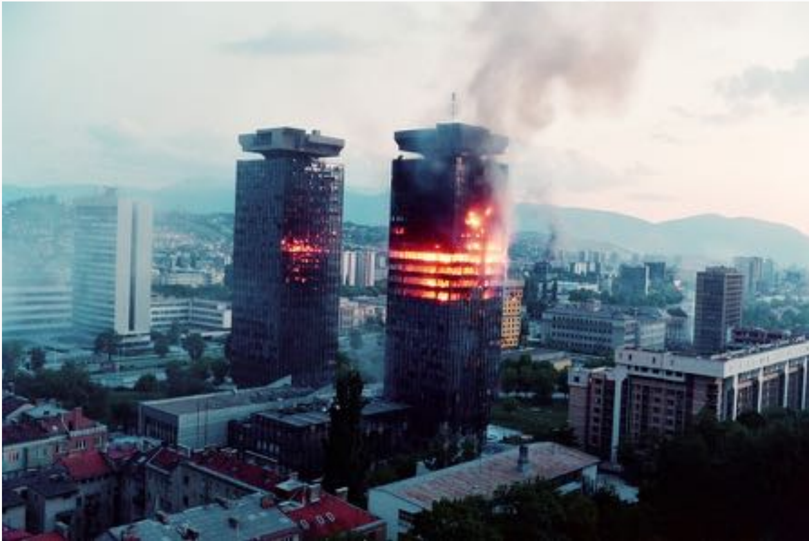
Sarajevo, Bosnia and Herzegovina